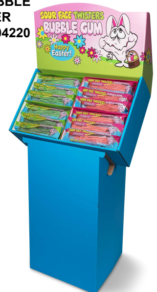
EASTER BUBBLE GUM SHIPPER OUR ITEM #04220