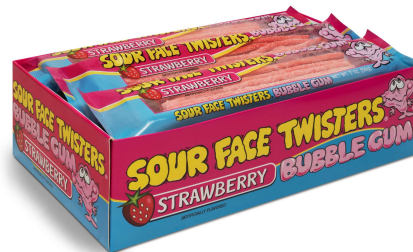
STRAWBERRY SOUR BUBBLE GUM STRAWS MCLANE'S UIN # 749157