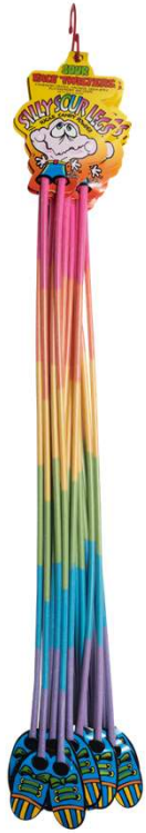
SILLY SOUR LEGS® SOUR FRUIT-FLAVORED POWDER MCLANE'S UIN # 041210