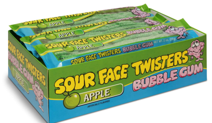
GREEN APPLE SOUR BUBBLE GUM STRAWS MCLANE'S UIN # 749177