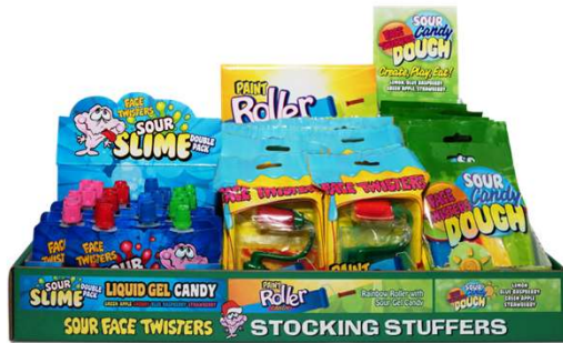
HOLIDAY SHELF TRAY OUR ITEM #13030