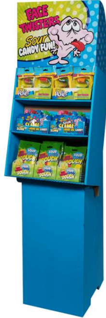
NOVELTY FLOOR SHIPPER MCLANE'S UIN # 810137