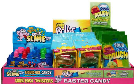
EASTER NOVELTY SHELF TRAY OUR ITEM #13020