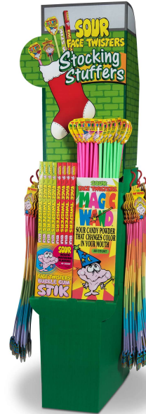
HOLIDAY SOUR CENTER OUR ITEM #09012