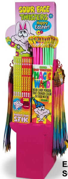
EASTER SOUR CENTER OUR ITEM #09013