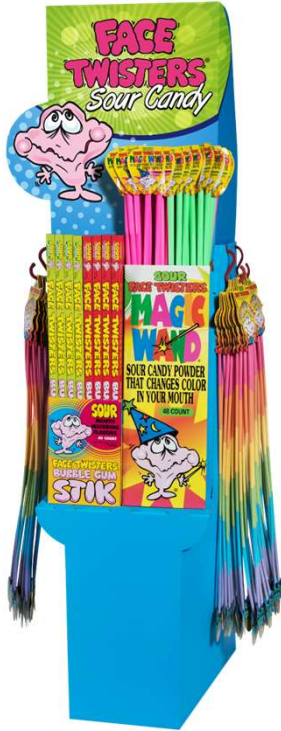
SOUR CENTER ASSORTMENT A FLOOR SHIPPER MCLANE'S UIN # 810157