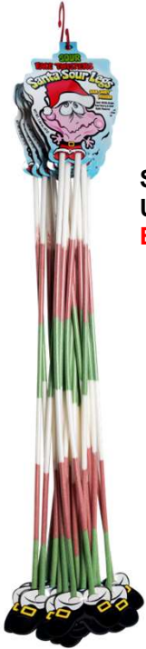
SANTA SOUR LEGS® UIN 497747 (ACTIVE UIN BUT NOT IN STOCK)