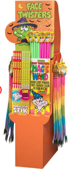
HALLOWEEN SOUR CENTER UIN # 576127 (ACTIVE UIN BUT NOT IN STOCK)