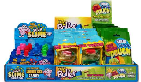
NOVELTY SHELF TRAY MCLANE'S UIN # 810167