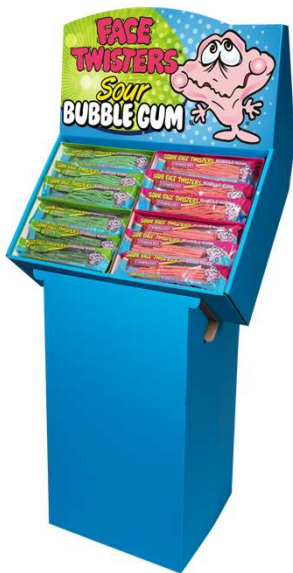
SOUR BUBBLE GUM SHIPPER MCLANE'S UIN # 810147